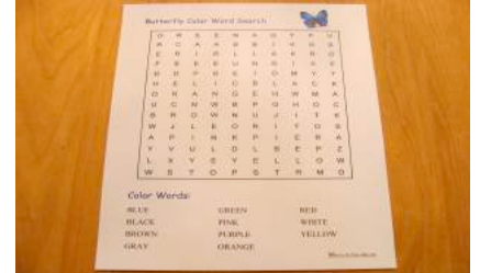
Butterfly color-word search