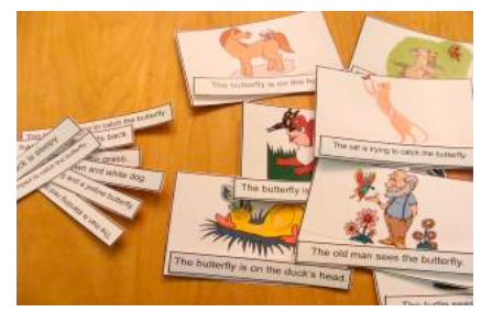
Butterfly reading comprehension