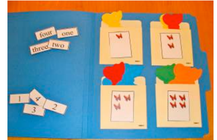
Count and match butterflies