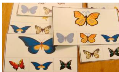
Identify matching butterfly