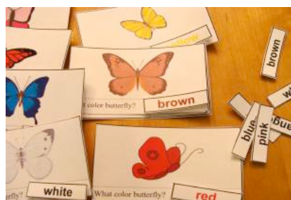
Read and match color words