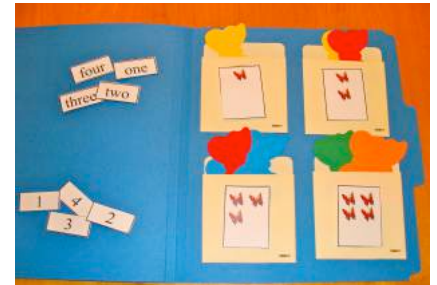
Count and match butterflies