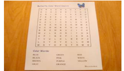
Butterfly color-word search