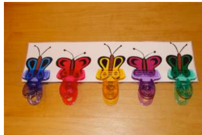
Butterfly color match