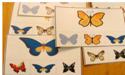
Identify matching butterfly