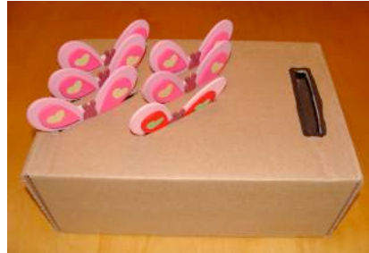
Put-in wooden butterflies

Task sets are not recommended for students who put non-edible items in their mouths.