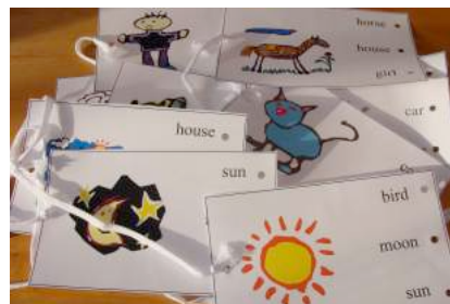
Reading words string along