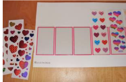
Sticker 1 to 1 correspondence

Task sets are not recommended for students who put non-edible items in their mouths.