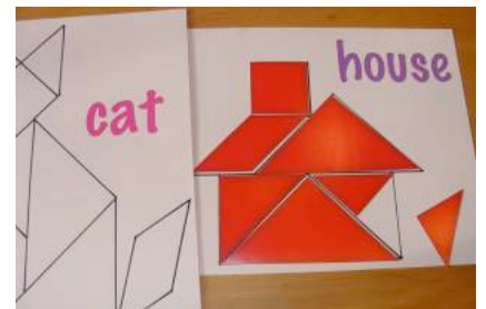
Create objects with shapes