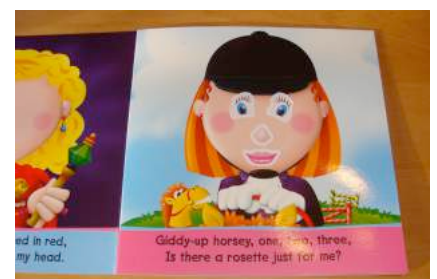
Making faces sticker book