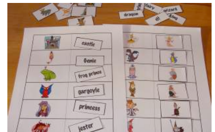
Fairy tale match