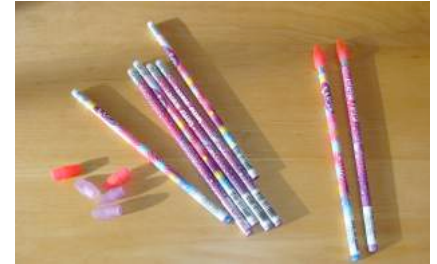
Put erasers on