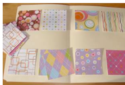
Girl themed pattern match