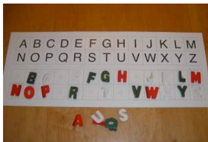
Letter match and order