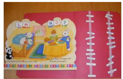
Adapted alphabet book