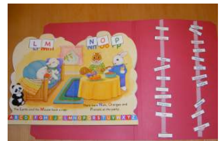
Adapted alphabet book