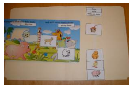
Adapted picture book