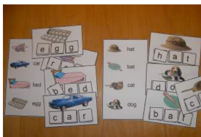
Spell a word