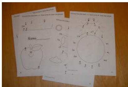
Alphabet dot to dots