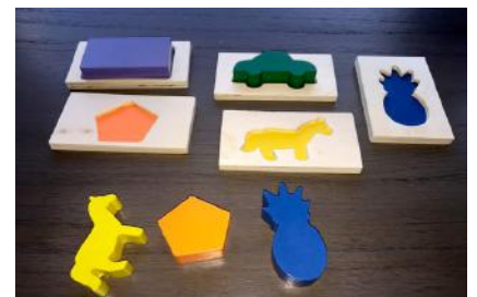
Wooden Shape Match