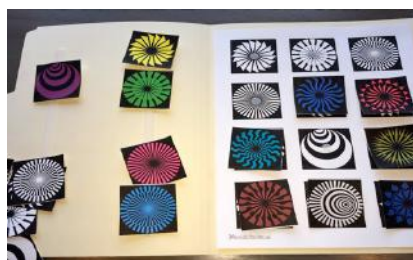
Abstract Shape Match