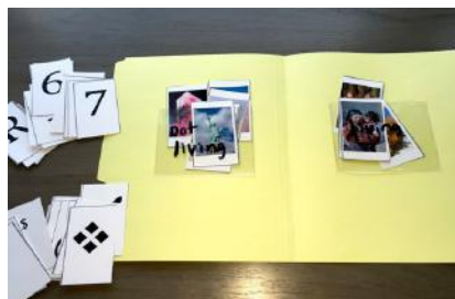
Big/Little, Letter/Number, Living/Not Living Sort