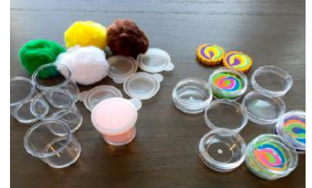
Pom-pom and Eraser Sort