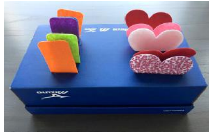
Felt Shape Sort

Task sets are not recommended for students who put non-edible items in their mouths.