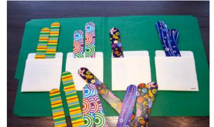
Popsicle Stick Sort