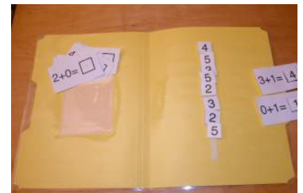
Addition to 5