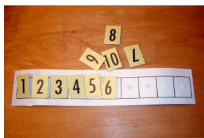
Order numbers 1-10