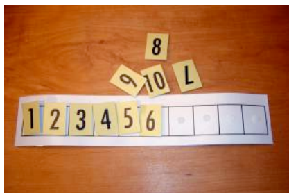
Order numbers 1-10