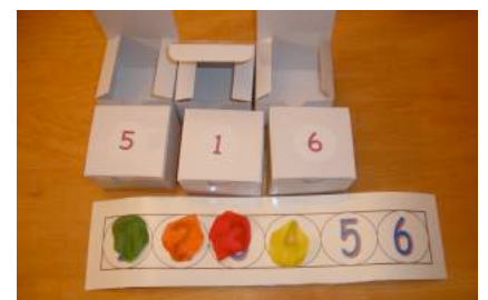
Package sets 1-6