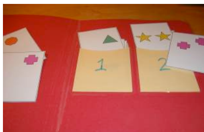
Sort sets of 1 and 2