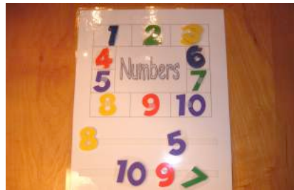
Number match 1-10

Task sets are not recommended for students who put non-edible items in their mouths.