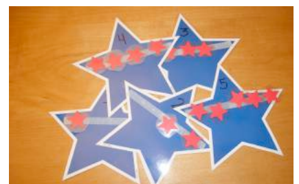
Match sets to numbers 1-5