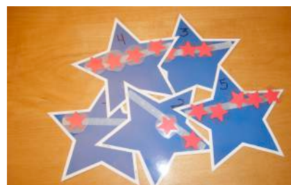
Match sets to numbers 1-5