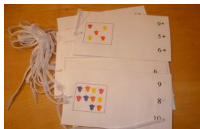
String along sets 1-10