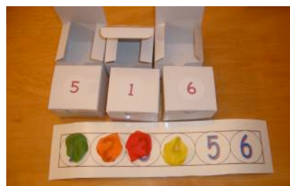
Package sets 1-6