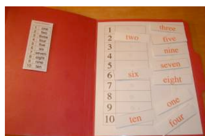
Read number words