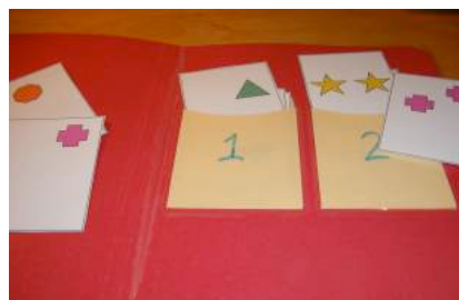
Sort sets of 1 and 2