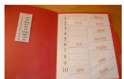
Read number words