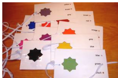
Color word string along