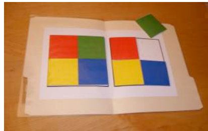
Four-color block design