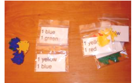
Package color fish