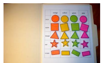
Color and shape grid