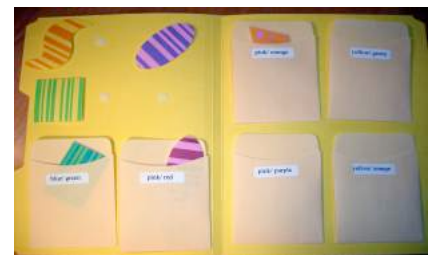
Read and sort