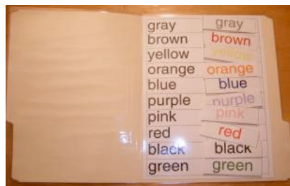
Color word match