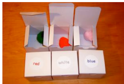
Package colored pom-poms