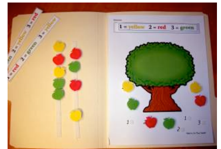
Number coded apple match