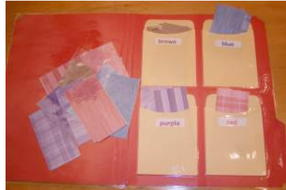
Sort color patterns in pockets

Task sets are not recommended for students who put non-edible items in their mouths.